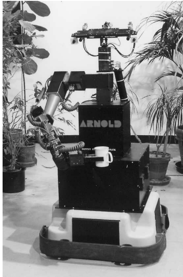
Figure 1: Arnold

Anthropomorphic shape and the fluent, predictable movements of effectors controlled by dynamical systems rather than stiff trajectories also have a strong effect on users which makes working with such a robot aesthetically and emotionally more pleasing.