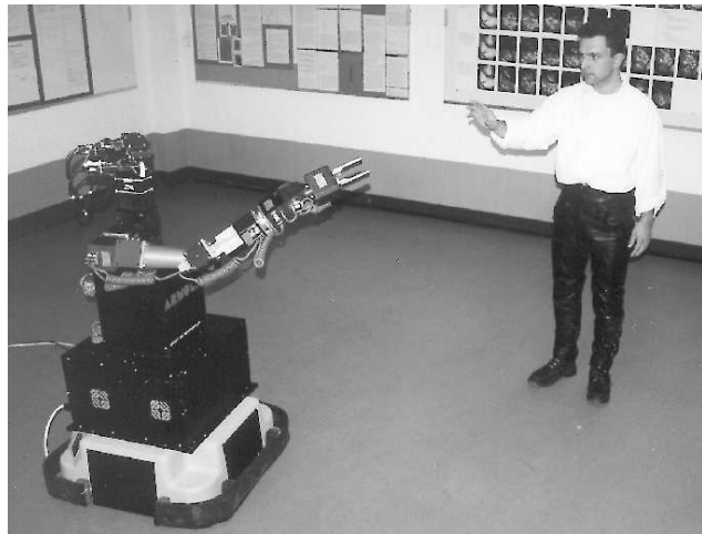
Figure 2: Grasping for a hand

To demonstrate our ideas, we have specified two example tasks Arnold should be able to perform at the end of the project. The first one is finding and grasping a cup. Arnold has no knowledge about its surroundings and thus needs an exploration and navigation system working properly in indoor environments. It has to search for the cup and establish a world model so that it can bring back the cup to the starting point. This system is implemented as a simulation and is currently being ported to the robot. The robot has to avoid static and dynamic obstacles in a “rich“ indoor environment. The robot has to approach the object, e.g. a table with a cup, very closely, so that the cup is in a good position to grasp. For this subtask a goal movement based on the 3-D object shape is currently being developed as a dynamical system. In the context of grasping we concentrate our efforts on realtime visually controlled arm movement in an environment with lots of obstacles. Hence, we also develop a method of estimating the 3-D position of the object to grasp and of the obstacles to avoid.