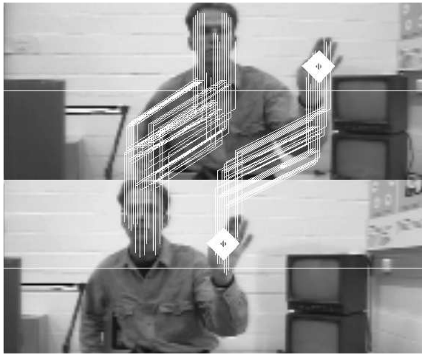
Figure 4: Stereo image pair with corresponding skin colored image points and target location marked.

For the hand following task Arnold is controlled by three simple behaviors. The first behavior moves the platform to a distance of about one meter to the target location. The second one moves the gripper to the 3-D coordinates of the hand and the third one moves the camera system in order to fixate the target. Each of these behaviors is working independently and is implemented as a dynamical system. They are only coupled by the 3-D sensor information of the skin-colored area next to Arnold. So the complex behavior of hand-following emerges from the coupling of three relatively simple control loops. A detailed description can be found in Dahm, Bergener 1997 [2].